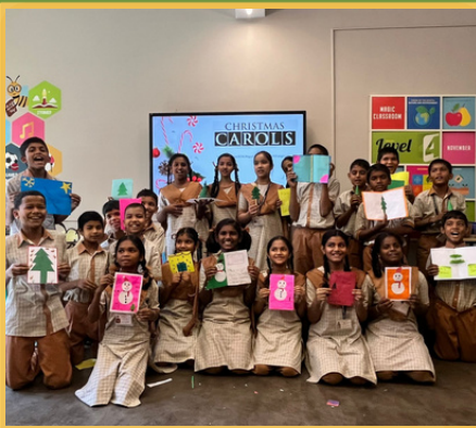
Christmas Celebration at Byculla School