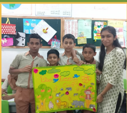
Biodiversity at Gilderlane School