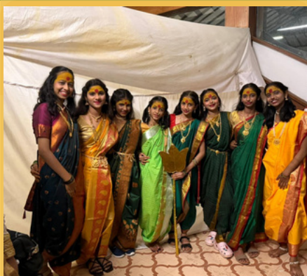
Spotlight by English Room