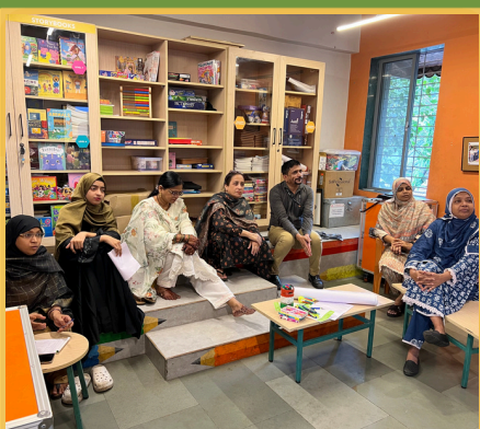
Inquiry based learning Workshop at Balaram School