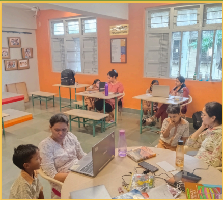
Midline Assessment at Sahakar Nagar School