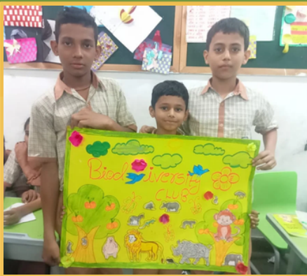
Biodiversity Club at Gilderlane School