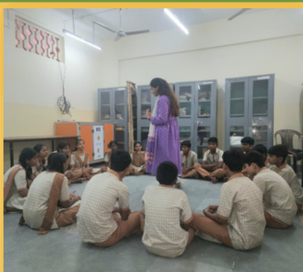
Theatre Session at Adarsh Nagar School

Teacher training sessions continued this month along with Saathi sessions and individual classroom support across 24 wards, further strengthening facilitation quality and teacher engagement. Saathi sessions were conducted regularly to build teacher confidence in delivering Functional English activities. Additionally, a 3-day training for new Shikshan Sevak teachers was conducted across all wards, helping them understand activity-based teaching, effective classroom management, and strategies for building student engagement. Regular AO and BO visits were also carried out to share updates and submit monthly progress reports, ensuring strong coordination and program alignment across wards.