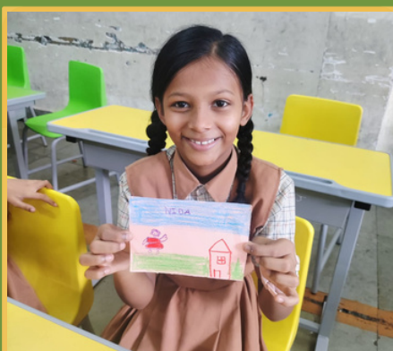
Introducing themselves with story character at Byculla School