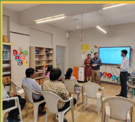
Saathi Session at Nariyalwadi School