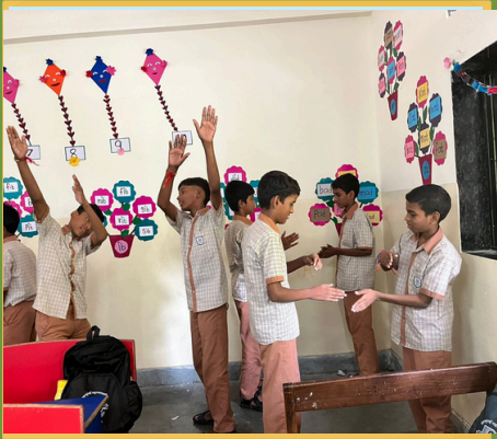
Mirror Activity at Adarsh Nagar School