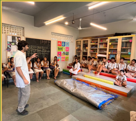
Mushroom Growing Workshop at Prabhadevi school