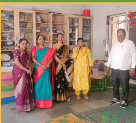
Hadapsar school 83B- Government official visit