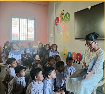
TMC School no. 38 - Story session