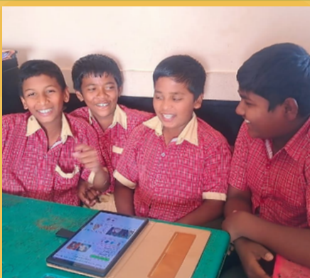
ZP Domkhel School- Asset Usage