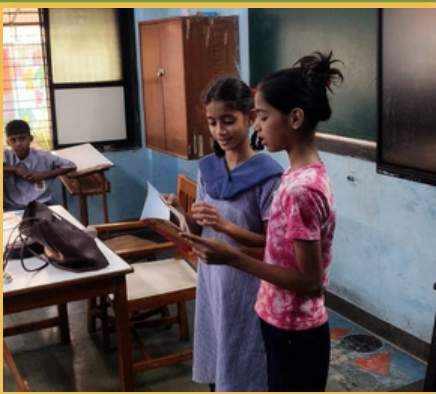
TMC School No 18 - Buddy System